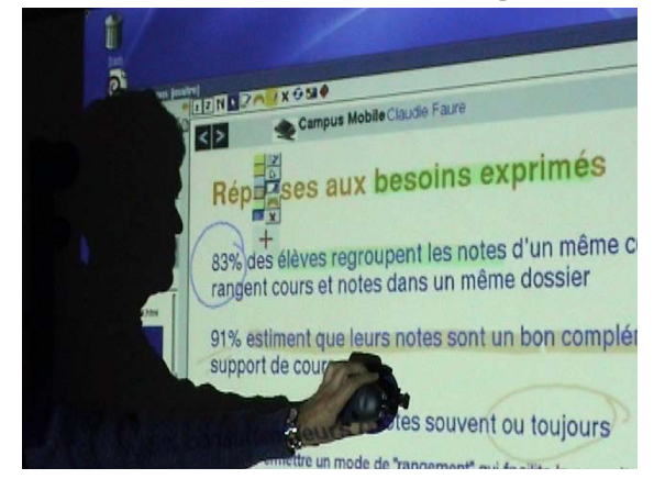
Figure 1: interactive whiteboard

In the CORAO scenario, unicast transmissions to a possibly large number of receivers would exceed the limited bandwidth of a wireless network. In section 6 we describe our broadcast solution that avoids this problem.